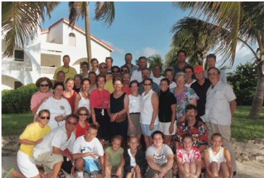
"Belize Mission Project 2002"

A Decade! When the participants of the Belize Mission Project finished that first trip nine years ago, I had no idea the project would still be going. Thanks to almost 400 trip participants it has remained a success. During this decade we have been