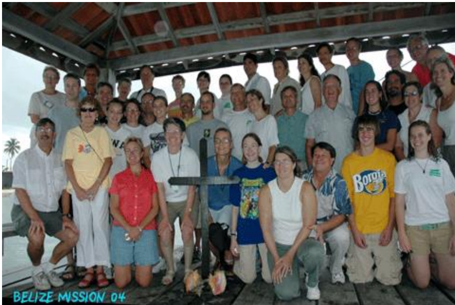
"Belize Mission Project 2004"